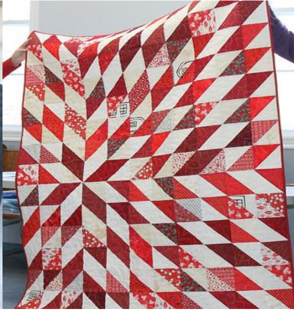
Cove Quilters Quilt of Valour