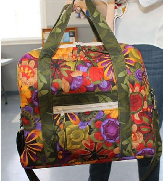
Colleen's Travel Bag